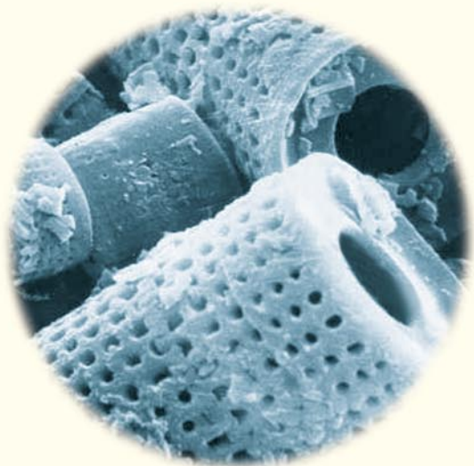
AXIS DIATOM MAGNIFIED 3000X

If Nature is an architect, the AXIS diatom is a masterpiece.